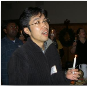
Japanese student joins in the singing of "Silent Night"